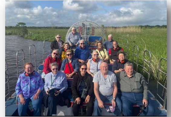
New Orleans/Natchez trip