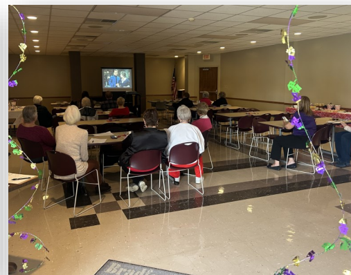
Feb 13th Mardi Gras/ Valentine's Day Party