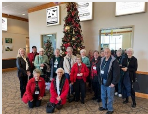
Dec 20th group to Effingham