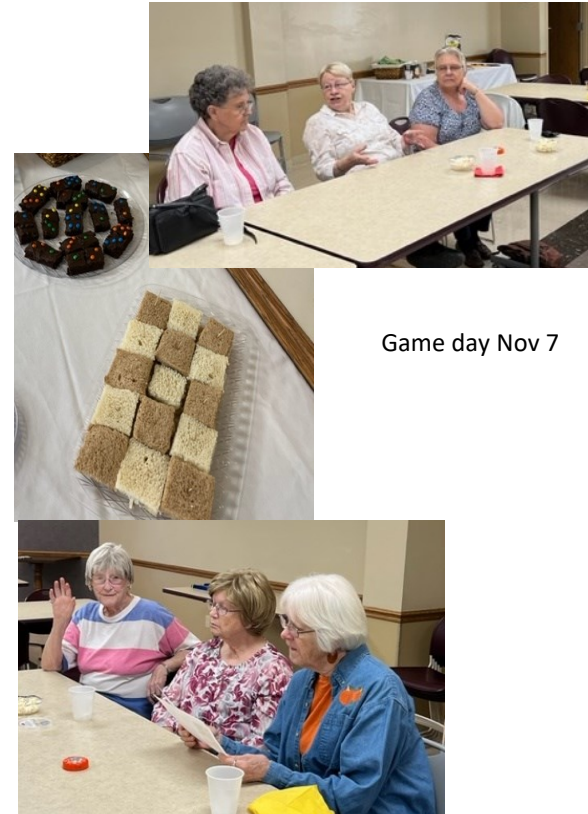
Game day Nov 7