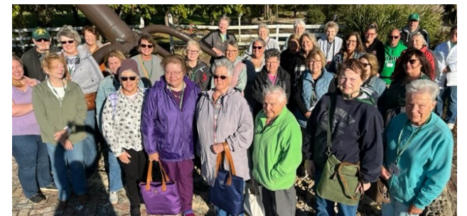
Covered Bridge Group at dinner Oct 20