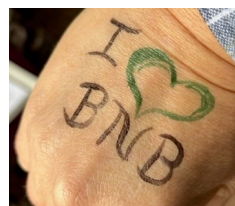
Carmen got a "tattoo" at the Covered Bridge Festival.

On Golden Pond ! The attendees of the September Open House voted for the show they would like to see most this Summer at Sullivan's Little Theatre on the Square. It was a tight race but On Golden Pond won out by one vote. July 12 we will be headed north for a wonderful day full of food, shopping, and fun! See the March newsletter for all the details.