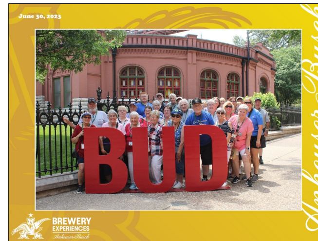
The group at the Budweiser tour.