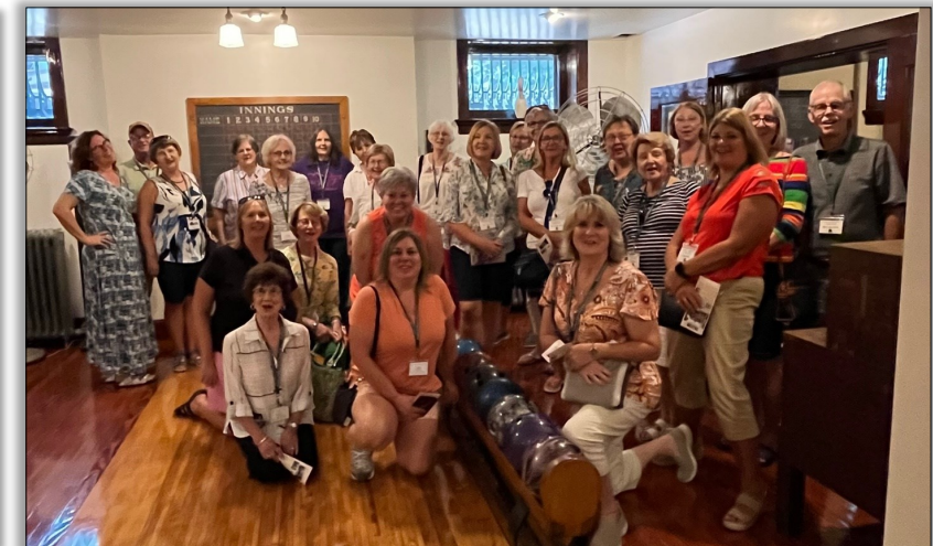
The Magic Chef Mansion. The group in the basement that hosts a one lane bowling alley.