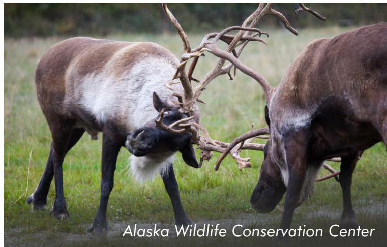
Alaska Wildlife Conservation Center