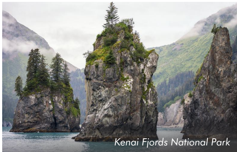
Kenai Fjords National Park